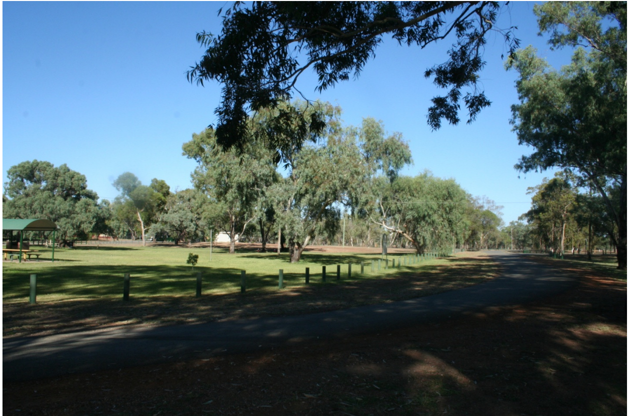
Figure 1 – The above photograph shows the eastern elevation of Rotary Park. This area was sown with couch grass and the irrigation system was repaired as described below. It is clearly evident that this work has been successful in re-establishing the flood damaged area and the new pump is providing effective irrigation.

It was evident that the existing irrigation system required significant maintenance, which involved flushing out the irrigation lines, replacement of sprinkler heads and filters and a substantial de-silting process of and around the well prior to installation of the replacement pump.