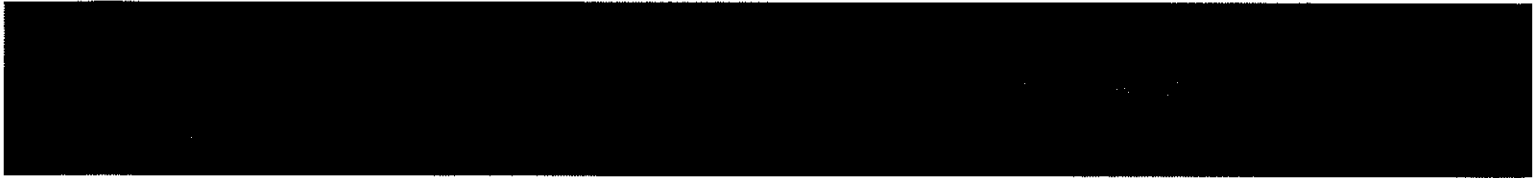
Table 1: Council's Strategic Objectives and Key Performance Indicators (KPIs) for 2018/19