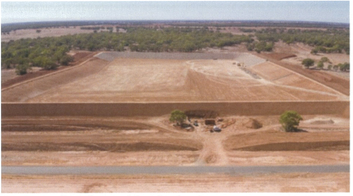
Storage Dam after completion of earthworks