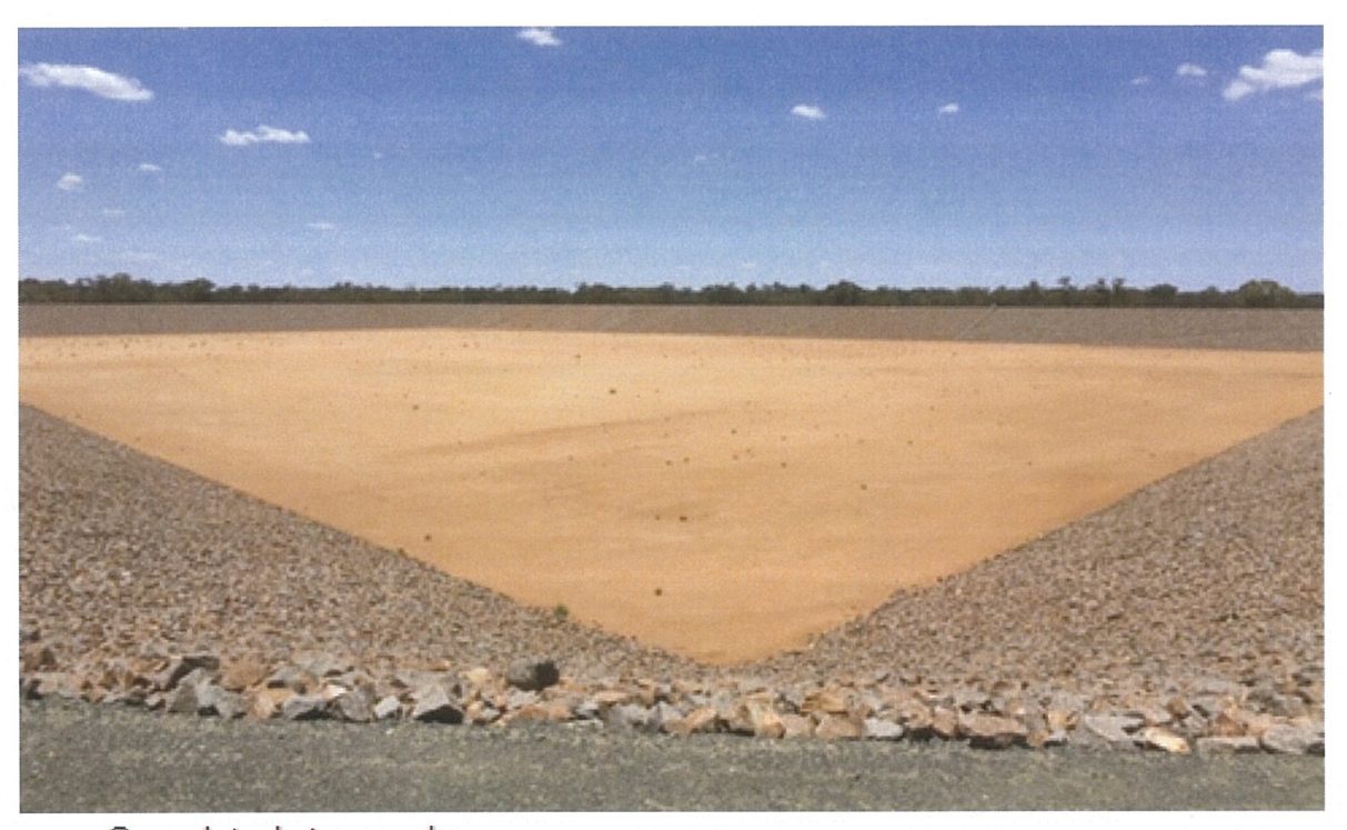
Completed storage dam